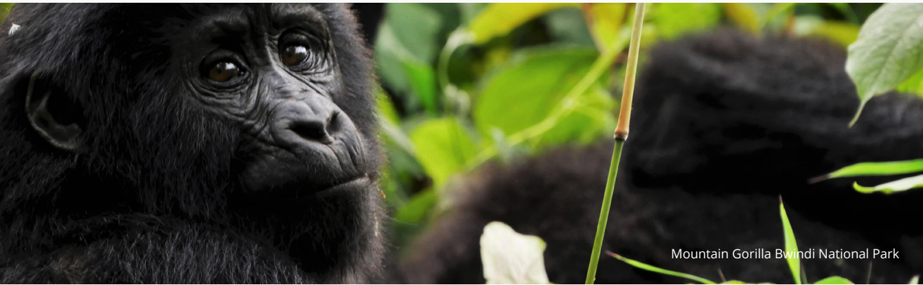
Mountain Gorilla Bwindi National Park