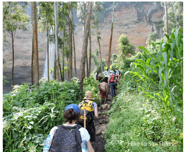
Hike to Sipi Falls