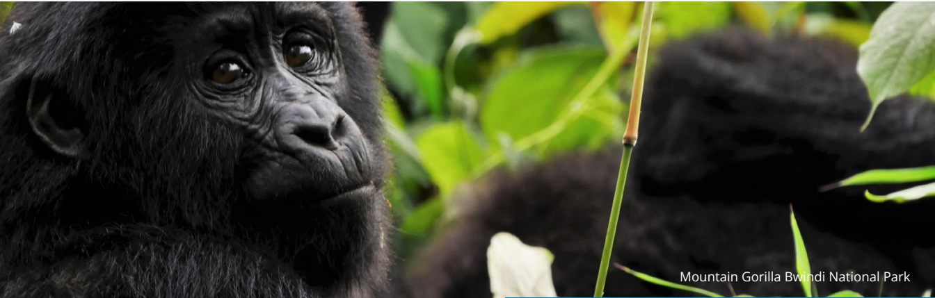
Mountain Gorilla Bwindi National Park