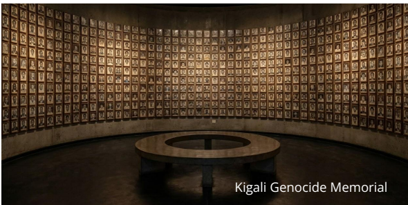
Kigali Genocide Memorial

Accommodation: Hotels Des Milles Collins, Meals: B