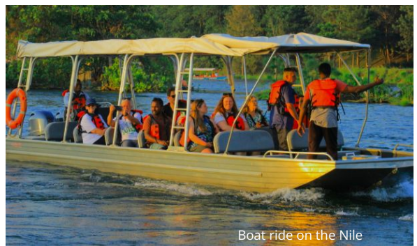
Boat ride on the Nile