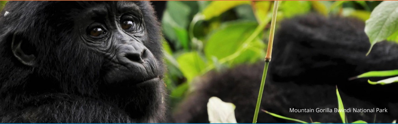
Mountain Gorilla Bwindi National Park