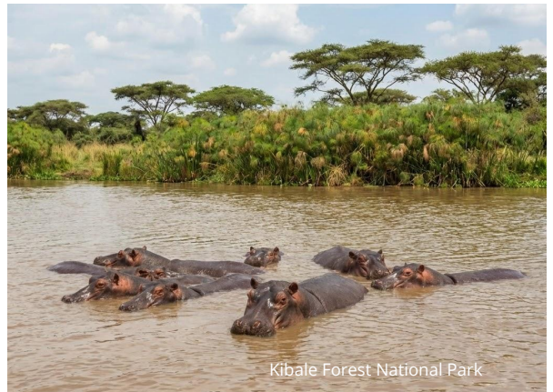
Kibale Forest National Park