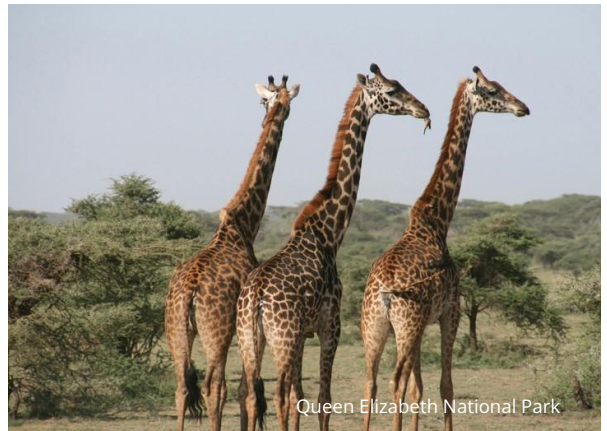
Queen Elizabeth National Park